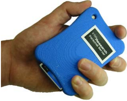
Figure 3 A Personal Server Prototype

Once again autonomic principles are required for this system to be successful, establishing a sense of self for the personal server and guarding against possible adverse data or programs that may be pushed onto it. In addition, proactive techniques are required for predicting the types of data the user needs, based on previous data access patterns, or the context of the user.